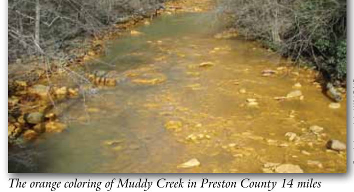
above Cheat Lake indicates acid mine drainage.