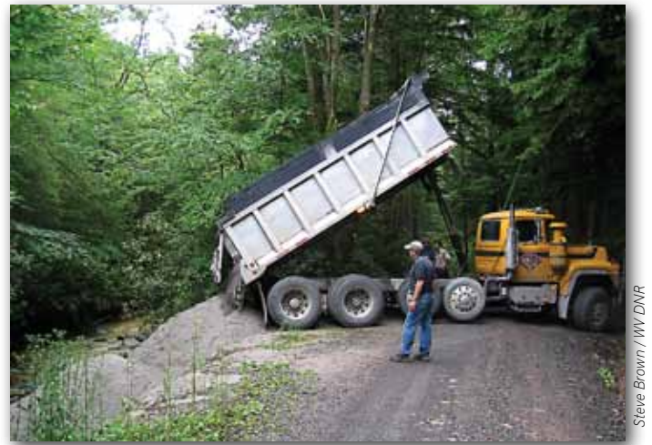
Limestone sands dumped into tributaries of the Cheat River help neutralize acidic waters in the stream and in the lake downstream.