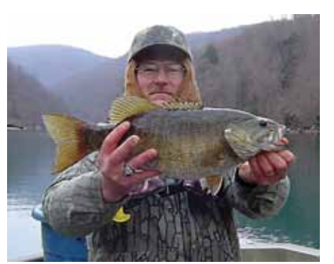
A trophy-size smallmouth bass caught in Cheat Lake.

The Federal Energy Regulatory Commission subsequently issued a renewal license to Allegheny Energy Supply (AES) for the Lake Lynn Project in 1994 for a term of 30 years. This new license